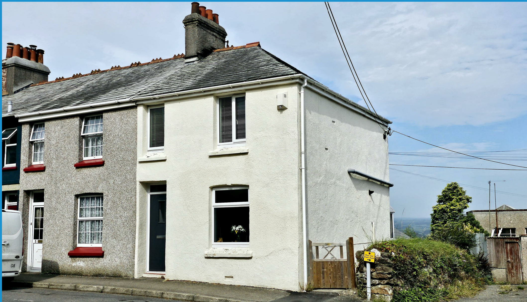
Druckham Terrace Launceston | Cornwall